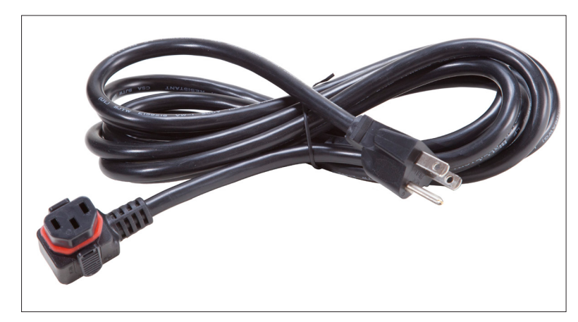
Only use compatible IEC320 C13 cables, as shown above